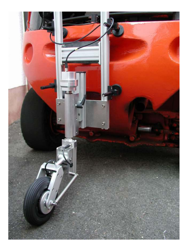
5W-6 Miniwheel with H-adapter and magnetic holders at the rear of a forklift truck