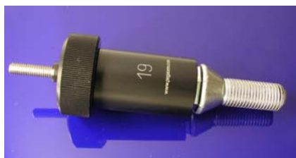
19mm Clamp Holder with Sleeve and Quick Fastener on a wheel bolt

The Clamps main property is its high holding force. It allows attachment of heavy equipment securely to the wheel nuts, even on very bad roads.