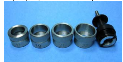
Magnetic holder shown with guide caps for 17, 19, 21, 22mm

The Magnetic Holders is a new proprietary and registered design. They are for quick and ease of connect/disconnect of the measuring equipment. The Magnetic Holders are ideal for series test of tires where frequent and quick changes are required. They offer a clear cost advantage due to their interchangeable Guide Caps and magnetic core element. Various cap sizes allow the use of one magnetic core element for different wrench sizes (e.g. 15, 17, 19, 21, 22, 24 and 27 mm).