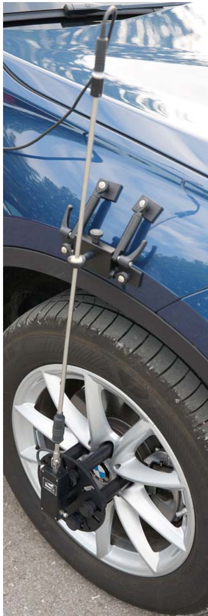
Modular Mounting System (MMS) and Wheel Speed Sensor (WSS) on the front wheel

Two different bolt variants are available for this system, Hexagonal Clamps (collects) or Magnetic Holders. Both are suitable for general use, each with special advantages in different applications.